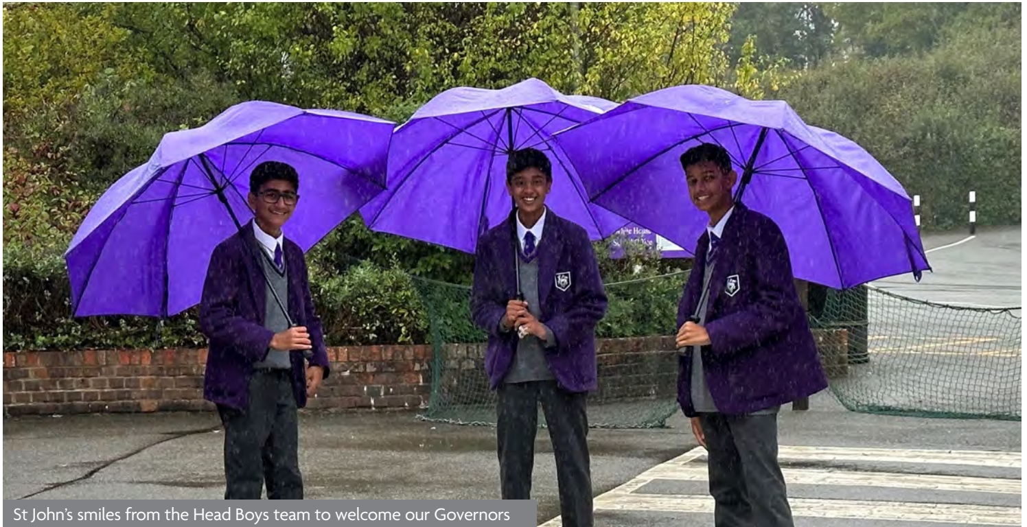
St John's smiles from the Head Boys team to welcome our Governors