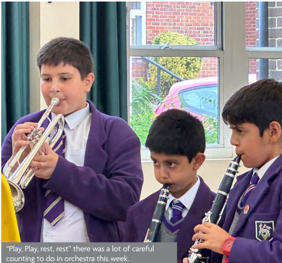
"Play, Play, rest, rest" there was a lot of careful counting to do in orchestra this week.