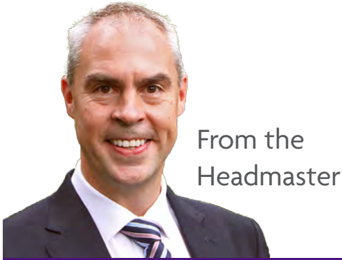
From the Headmaster