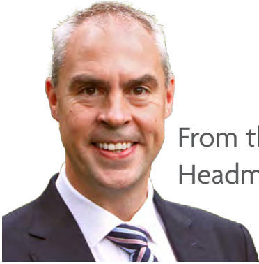
From the Headmaster