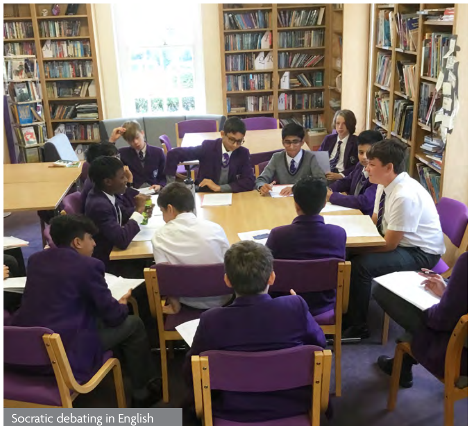
Socratic debating in English