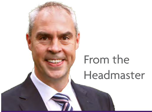
From the Headmaster