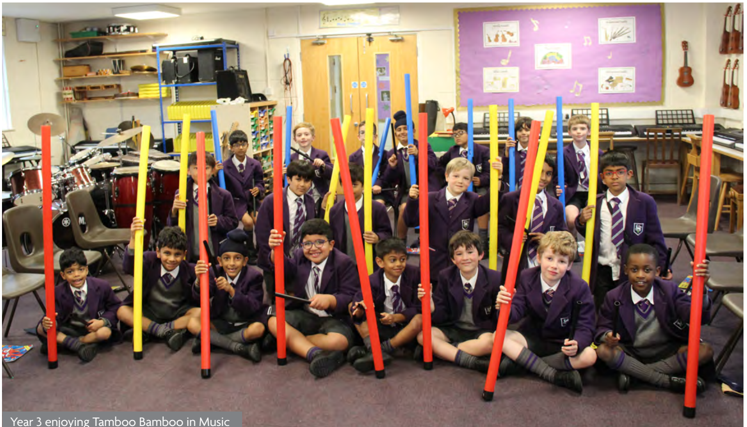
Year 3 enjoying Tamboo Bamboo in Music