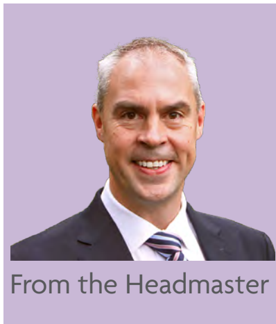
From the Headmaster

I was so proud of the wonderful support St John's boys, and parents offered to the new Lord Mayor of London at the show on Saturday. Our musicians (who, together with dramatists, are preparing for next week's Arts Evening on Thursday), flag designer, torch bearer and all participants were a credit to the School, and the Merchant Taylors' Company.