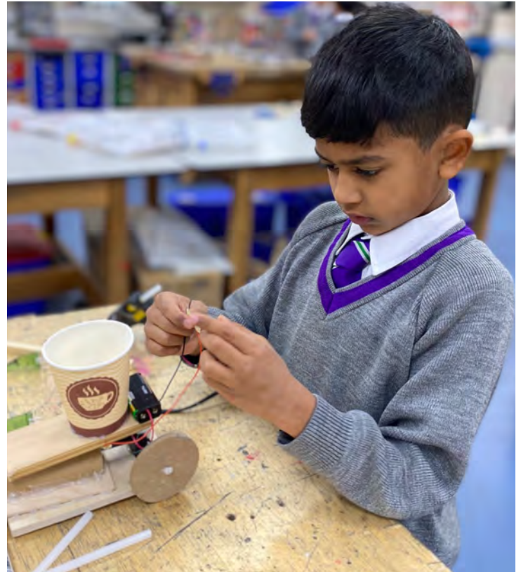
Year 4 test their motorised egg-mobiles and add the seating for Humpty (who is a real egg).