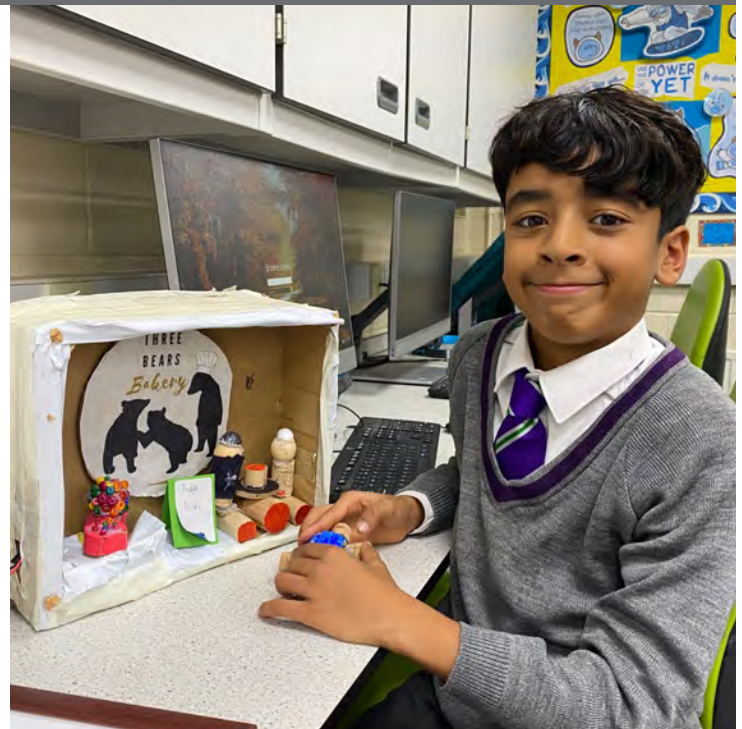
Our fabulous motorised shop window displays are ready to show you at Arts Evening!