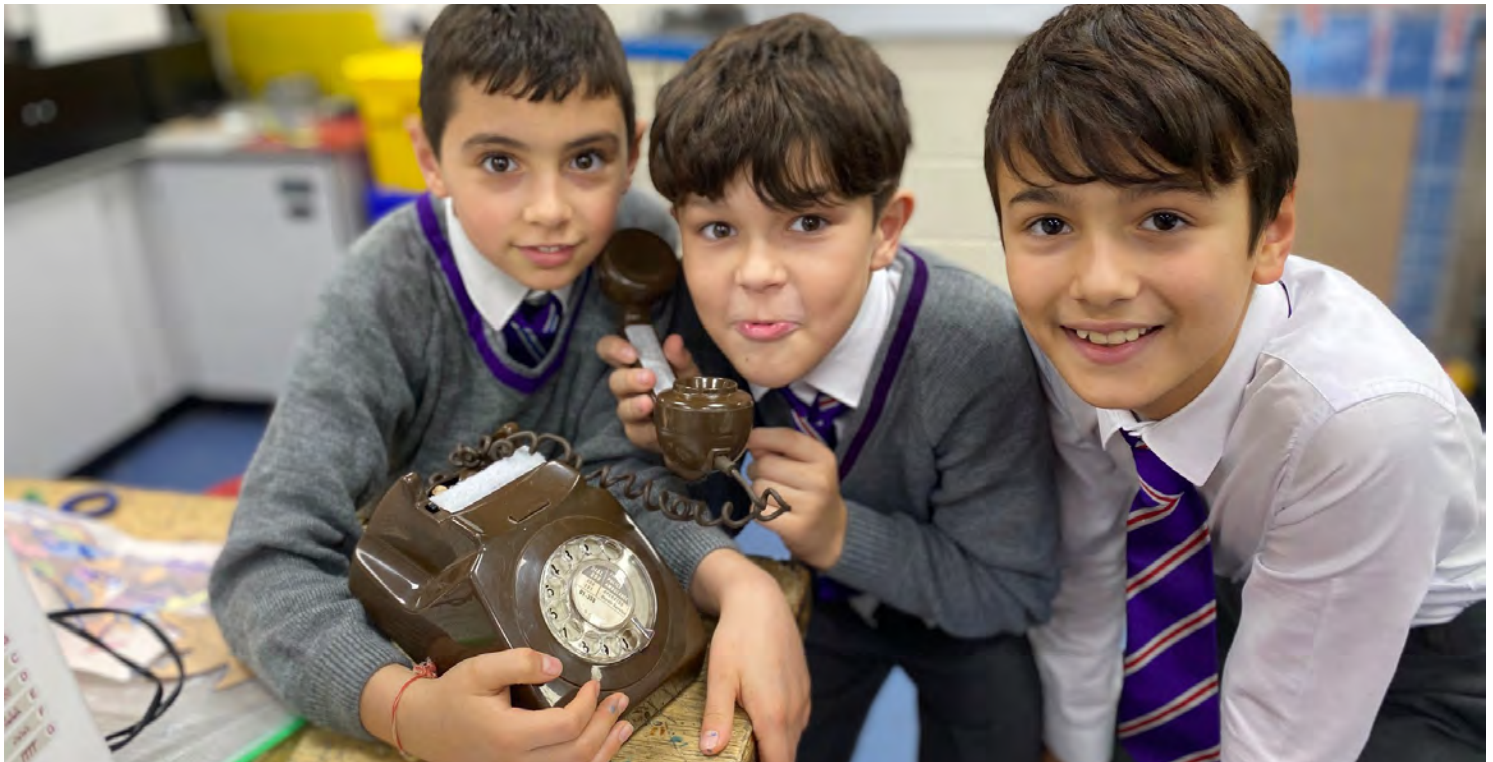
Is that all it does? Dialling 999 on this old phone in an emergency took ages!