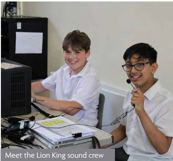
Meet the Lion King sound crew