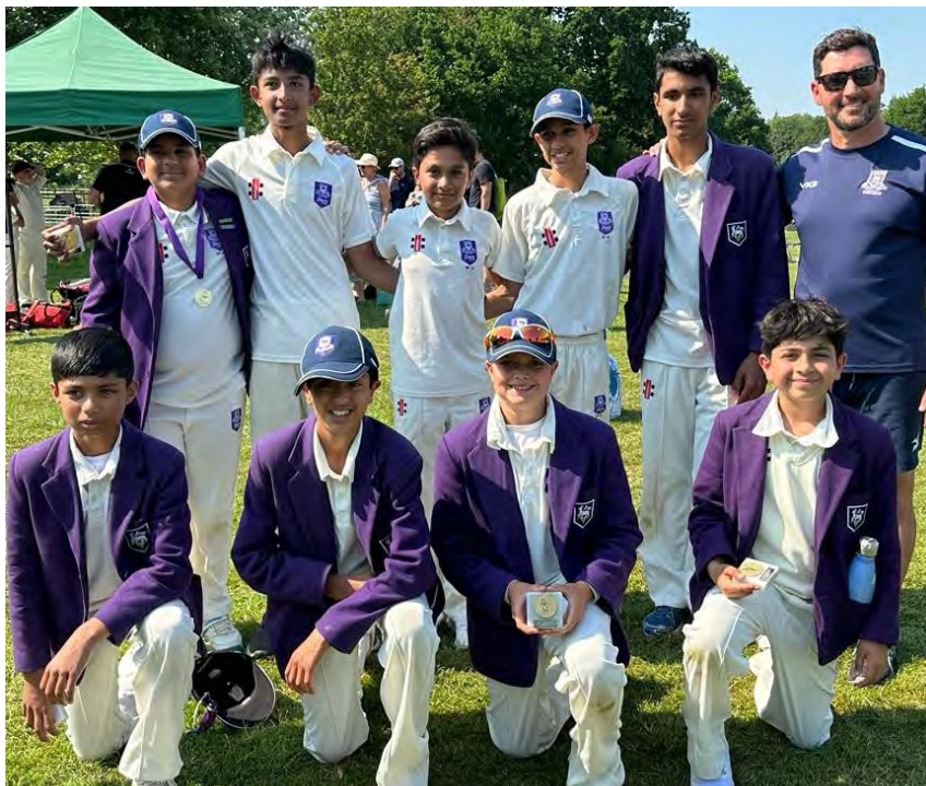
The U13s 6-a-side team were runners up at the York House tournament