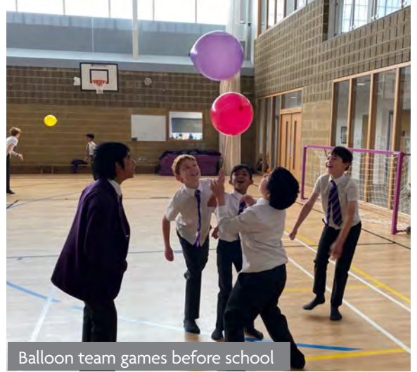
Balloon team games before school