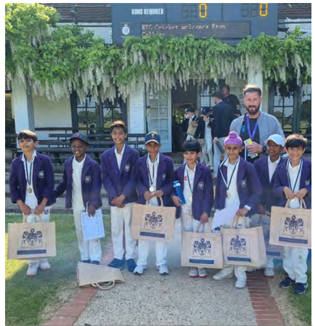
The U10s reached the final of the annual Lamb Trophy cricket tournament played at Merchant Taylors' on the Middlesex County Cricket Club wicket