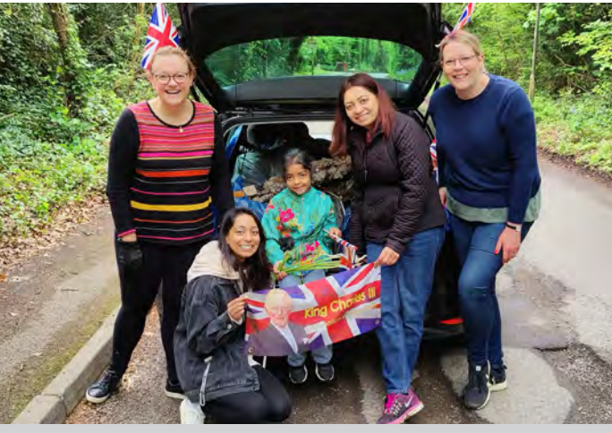
As the boys were in school on Monday, their families enjoyed volunteering and picking up litter on Potter Street Hill

Updates : Please continue to visit www.st-johns.org.uk for all the latest information on sports fixtures and results.