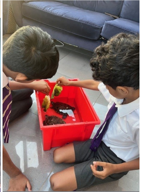
The turtles enjoyed their summer holiday!