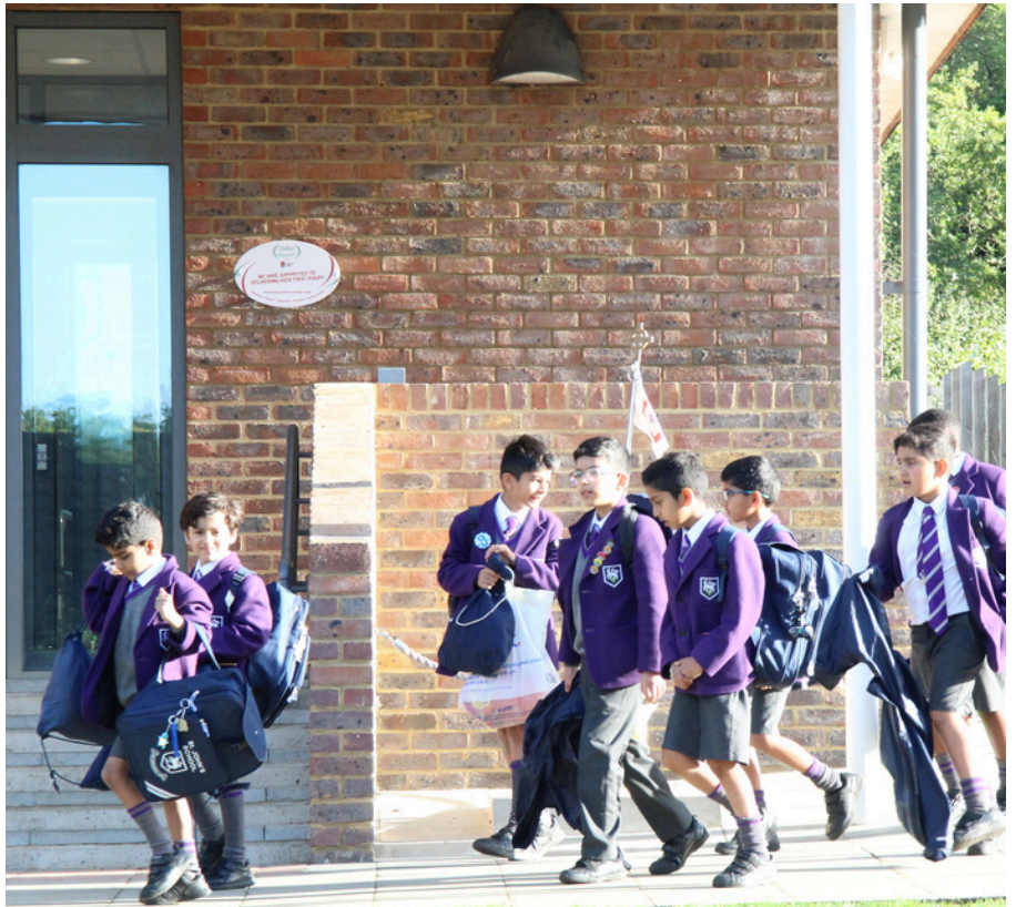
Deputy Head's Award for excellence